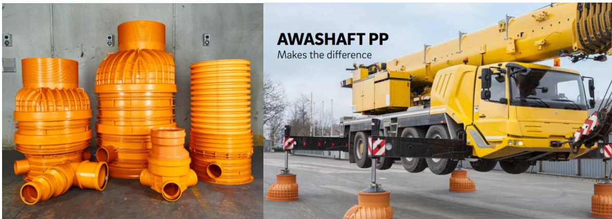
AWASHAFT PP Makes the difference