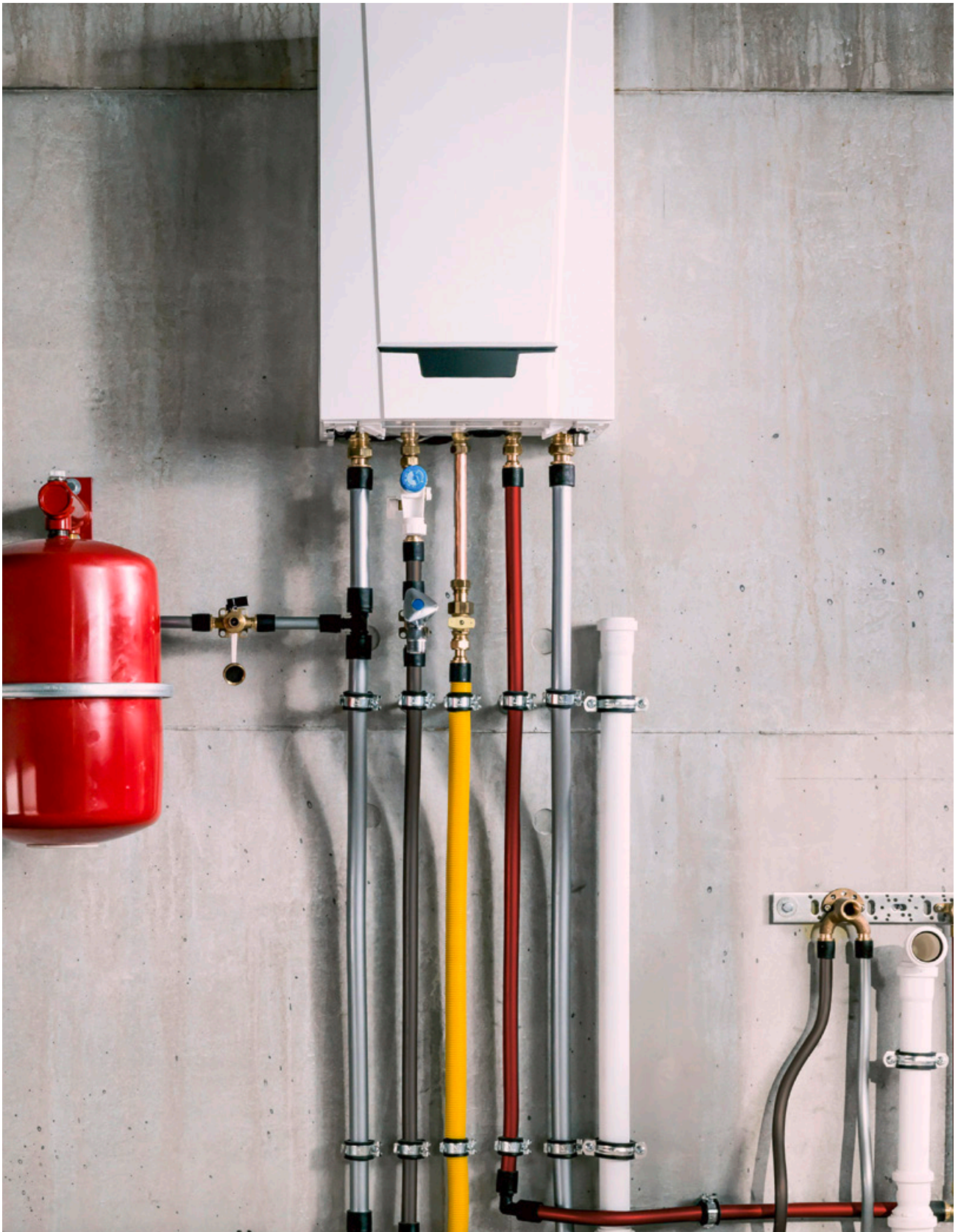
RAUTITAN water and gas services 16 - 63mm